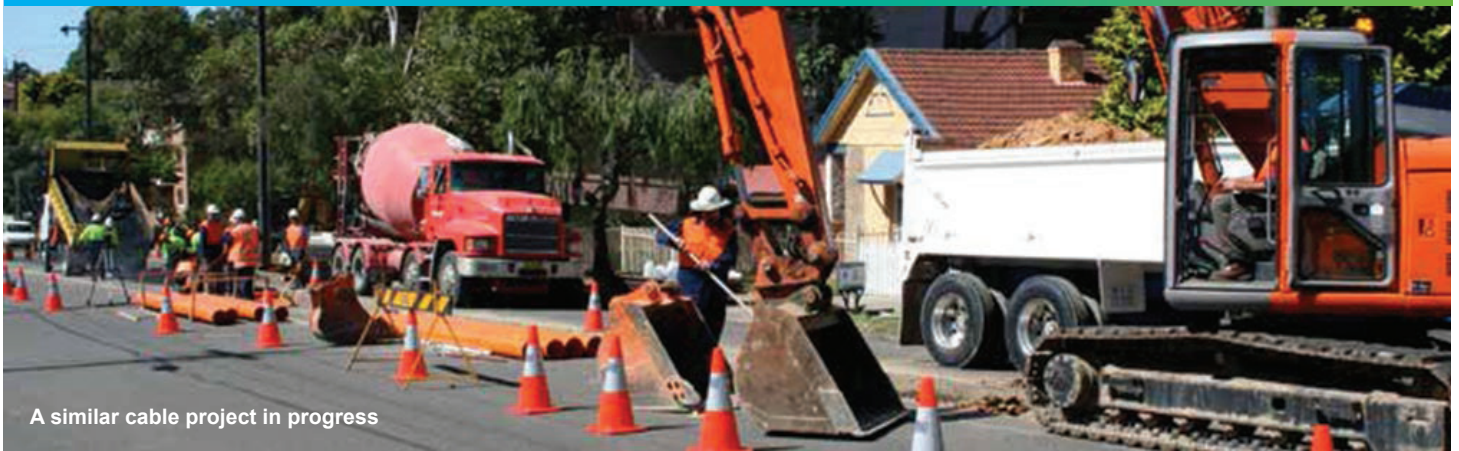
A similar cable project in progress