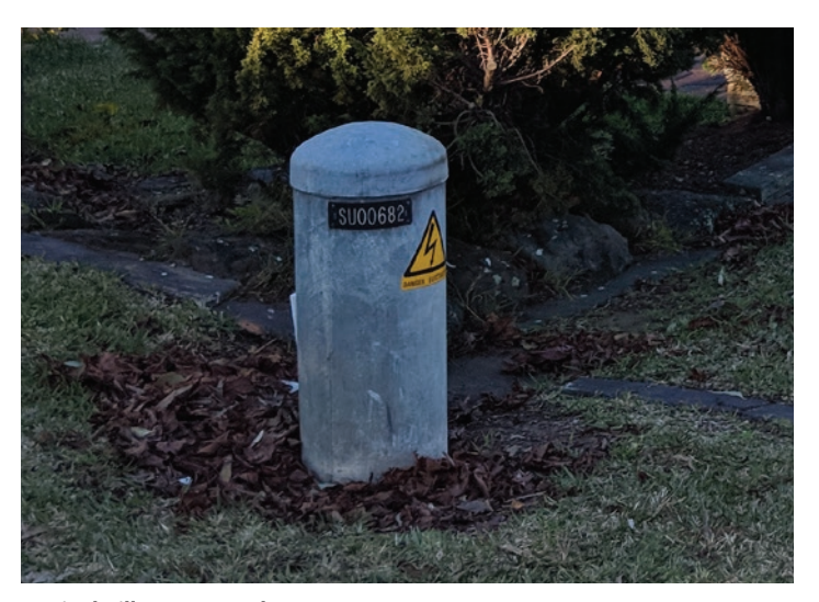
Typical pillar to be replaced