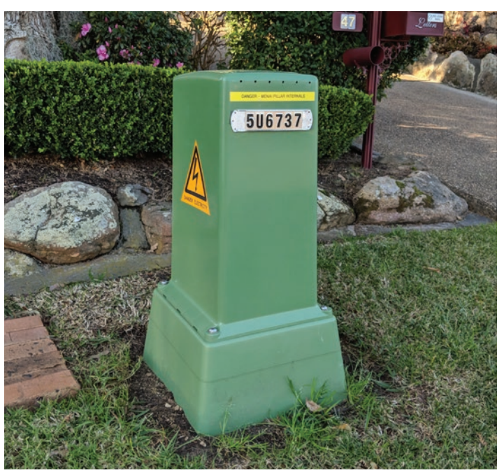
Typical current standard pillar to be installed