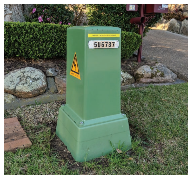
Typical current standard pillar to be installed