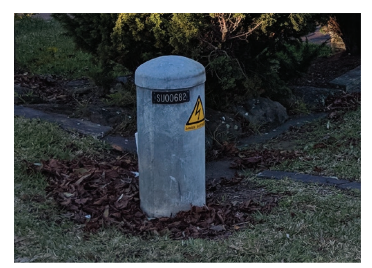
Typical pillar to be replaced