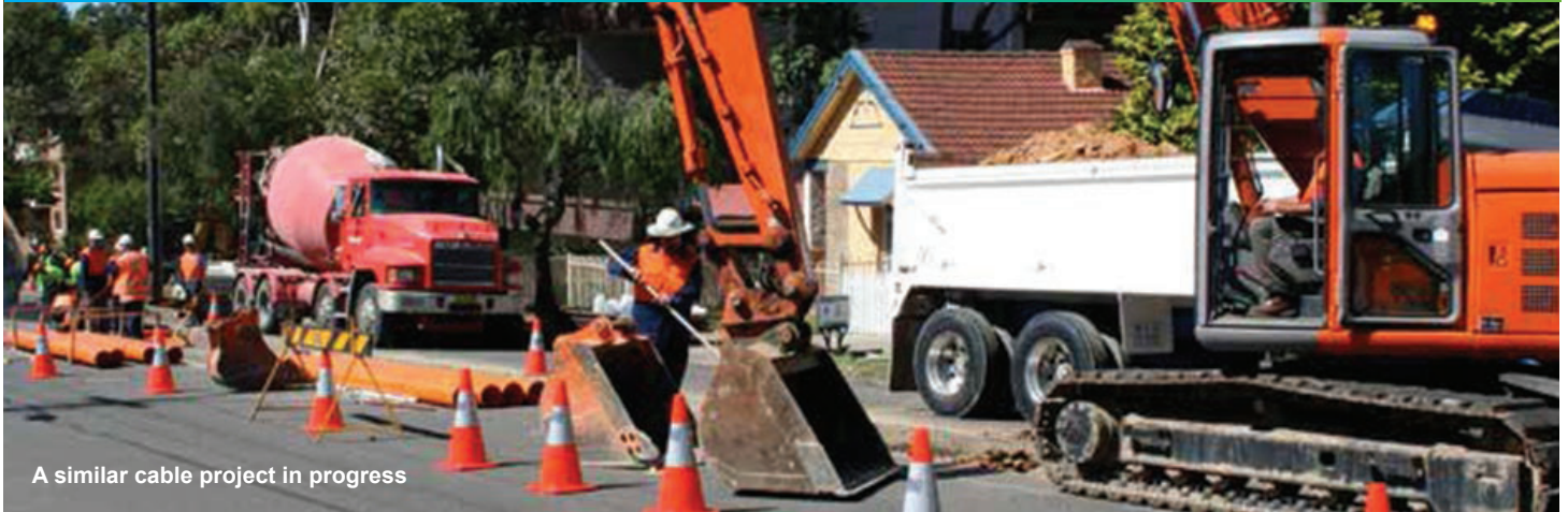
A similar cable project in progress