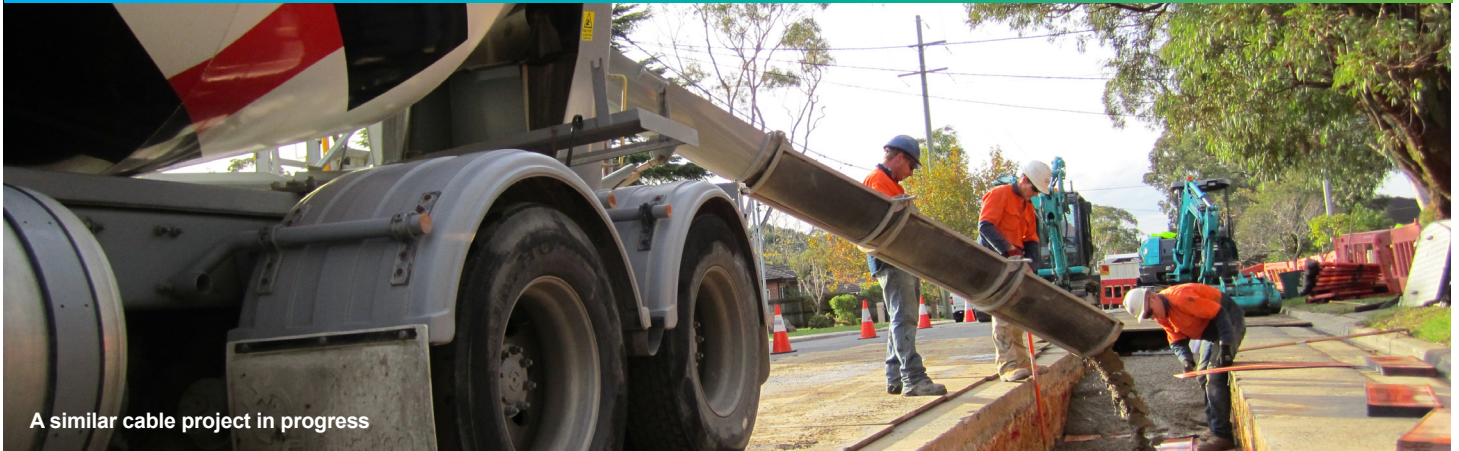
A similar cable project in progress