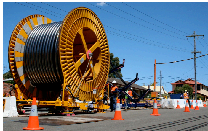
Cable installation on a similar project

Ausgrid will keep the community informed as the project progresses via updates like this one and notification letters. The latest project information will also be available on the project's web page (see below). There will also be an opportunity to make a submission on the environmental assessment.