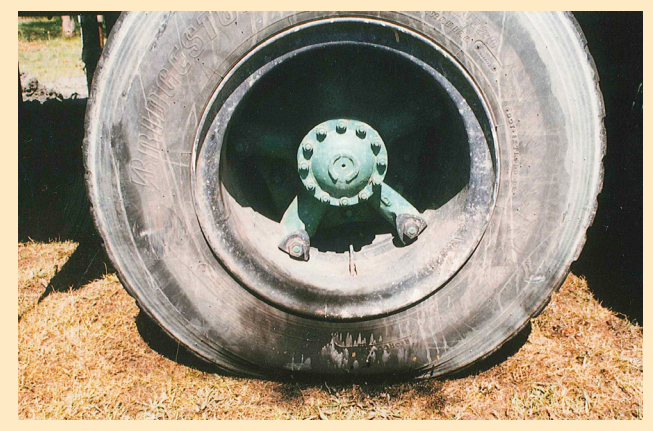
Concrete boom pump contact with overhead powerlines, result of electricity tracking through truck to earth.