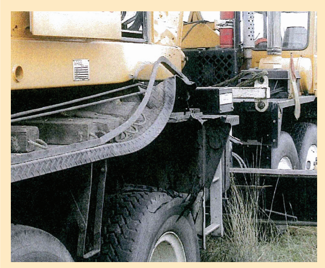
Crane contacted overhead powerlines resulting in tyre explosion and extensive damage to truck and crane.