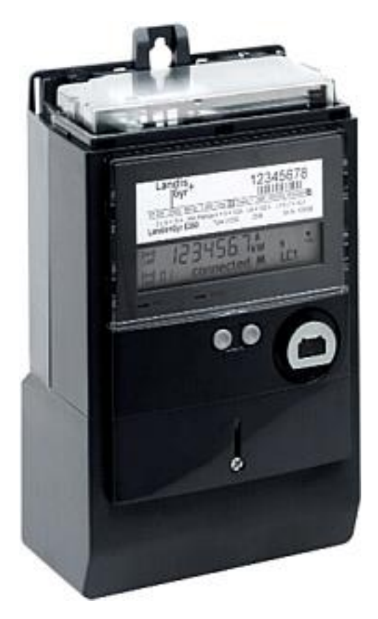
Figure 1 Example of a SGSC meter